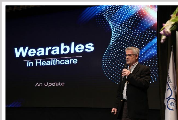
Health Tech Talk