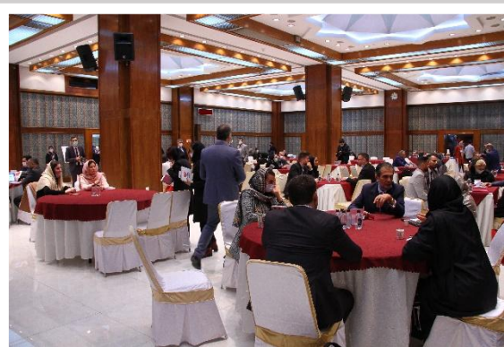
B2B & Gala Dinner