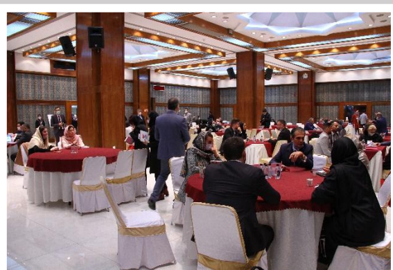
B2B & Gala Dinner